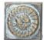
Metal C - Brass Verde Satin

Buttons: A, B & C available in all 5 metal and 5 ceramic colors