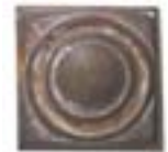
Iron Rustic A (Not for wet areas)