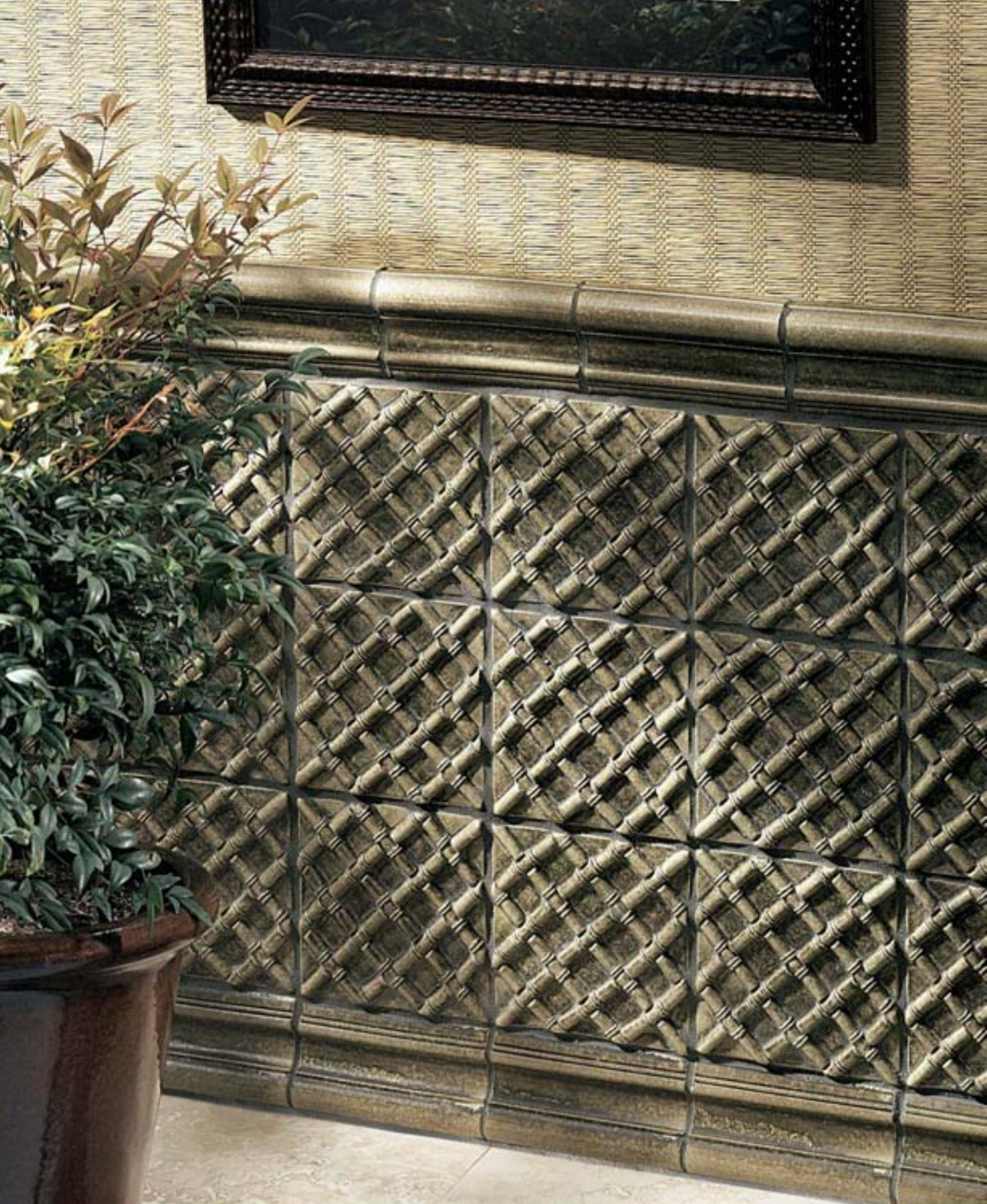
All tiles Woodland color: Hood Moulding; 6" x 6" Peter's Lattice