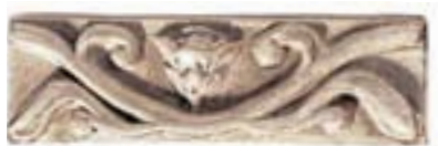
Anabel's Moulding - 2" x 6"