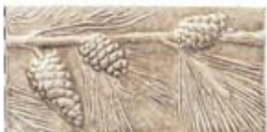
Needles and Cones - 3" x 6"