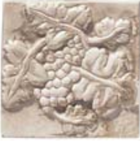
Grape Bunch and Deco /Corner