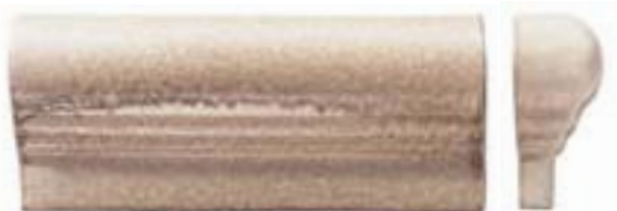
Cornice Moulding - 2 1/2" x 6"