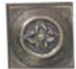
Metal B - Bronze Satin