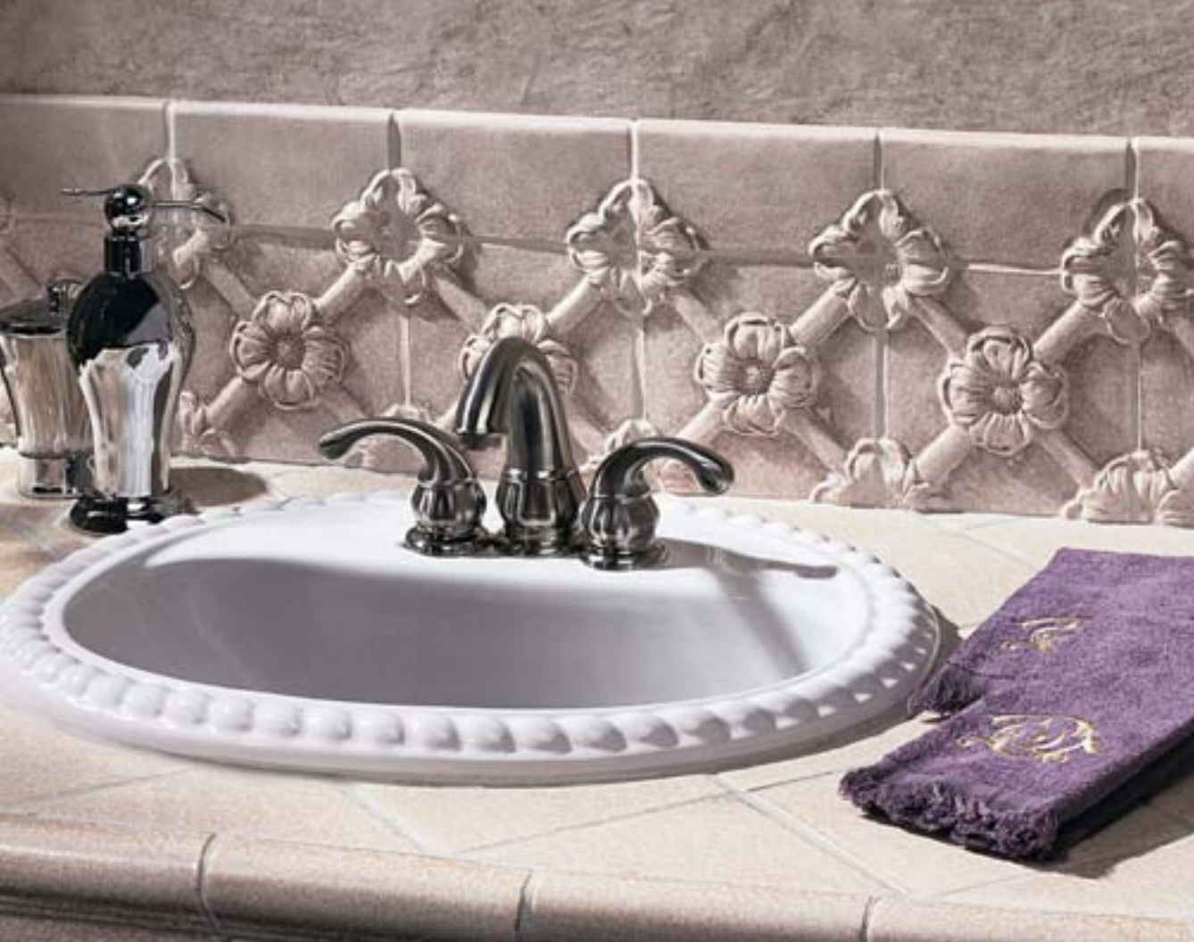
All tiles Cumberland color: Sonia's Flower; Sonia's Bullnose; 6" Field; Cornice Moulding