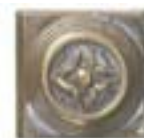
Metal B - Brass Antique