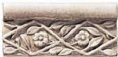
Daphne's Border - 3" x 6"