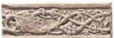
Grape Vine - 2" x 6"