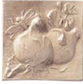
Onion and Dragonfly