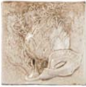
Artichokes and Lily

6" x 6" Decors - Available in all 5 Field colors