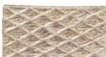
Rough Diamonds - 3" x 6"