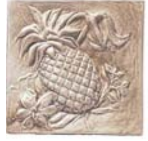
Pineapple and Daylily