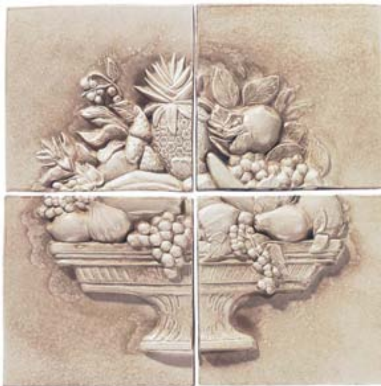
Plentiful Platter - 19" x 19" (Modules with 3 field tiles)