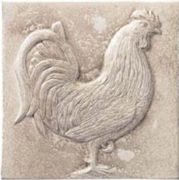
The Rooster - 12 1/2" x 12 1/2" (Modules with 2 field tiles)

Decorative Panels & Buttons - available in all 5 colors