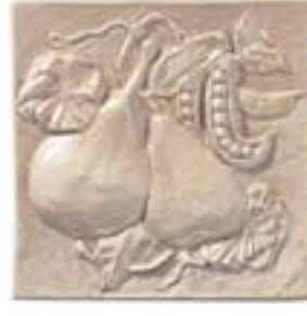
Pears and Peas