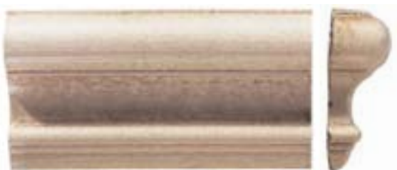
Hood Cap - 3" x 6"