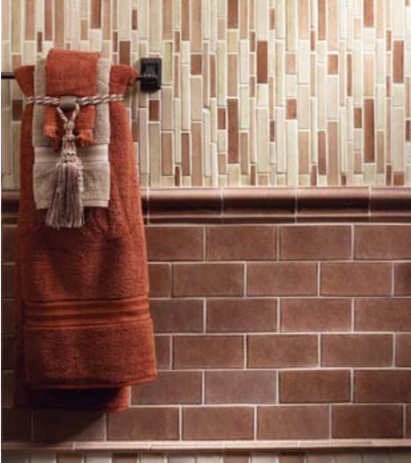
3" x 6" Field Tiles – Canyon; Linea & Square Mosaics – Bungalow; Hood Cap, Dome – Canyon.