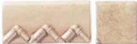
Peter's Lattice 3" x 6" and 3" x 3" (Bullnose - Double Bullnose)