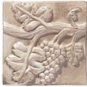
Stem and Grapes