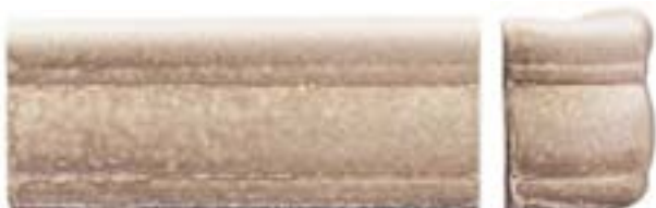
V Cap - 2 1/2" x 6"