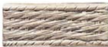
Rope and Weave - 2 1/2" x 6"