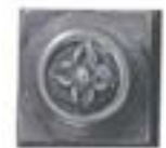
Metal B - Silver Antique