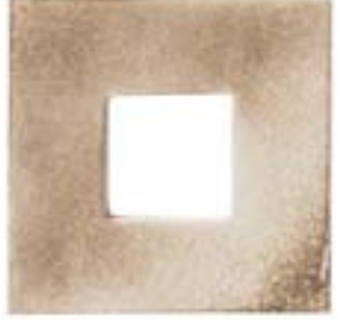
AH Picture Frame