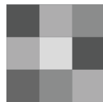
V4 - Substantial